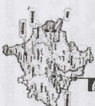
7th Contingent of ACR in KFOR 8th Contingent of ACR in KFOR

Since 2002 till July 2005, the ACR formed together with Armed Forces of the Slovak Republic a joint Czech-Slovak KFOR battalion that contributed to the Multinational Brigade CENTRE. In average, there were 500 Czech soldiers and 100 Slovak soldiers serving at the joint unit during that time. The cooperation of both armies at present goes on at the national level within KFOR. Prior to deployment to Kosovo, both national contingents met at the ceremony at the Czech-Slovak border crossing Bumbálka on 8 July 2005.