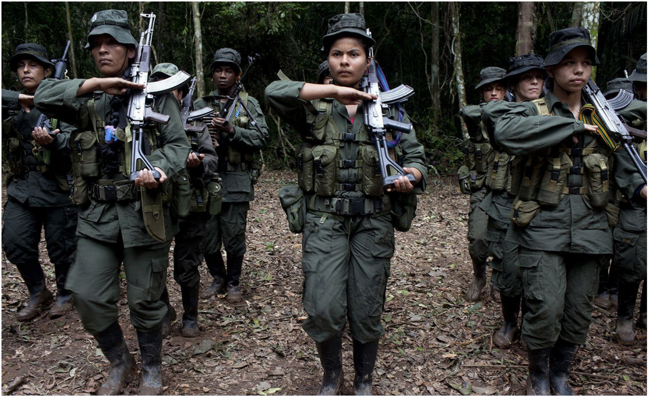
Photo caption: Women in the ranks of the FARC in La Macarena, Colombia. (Gerardo Inzunza)