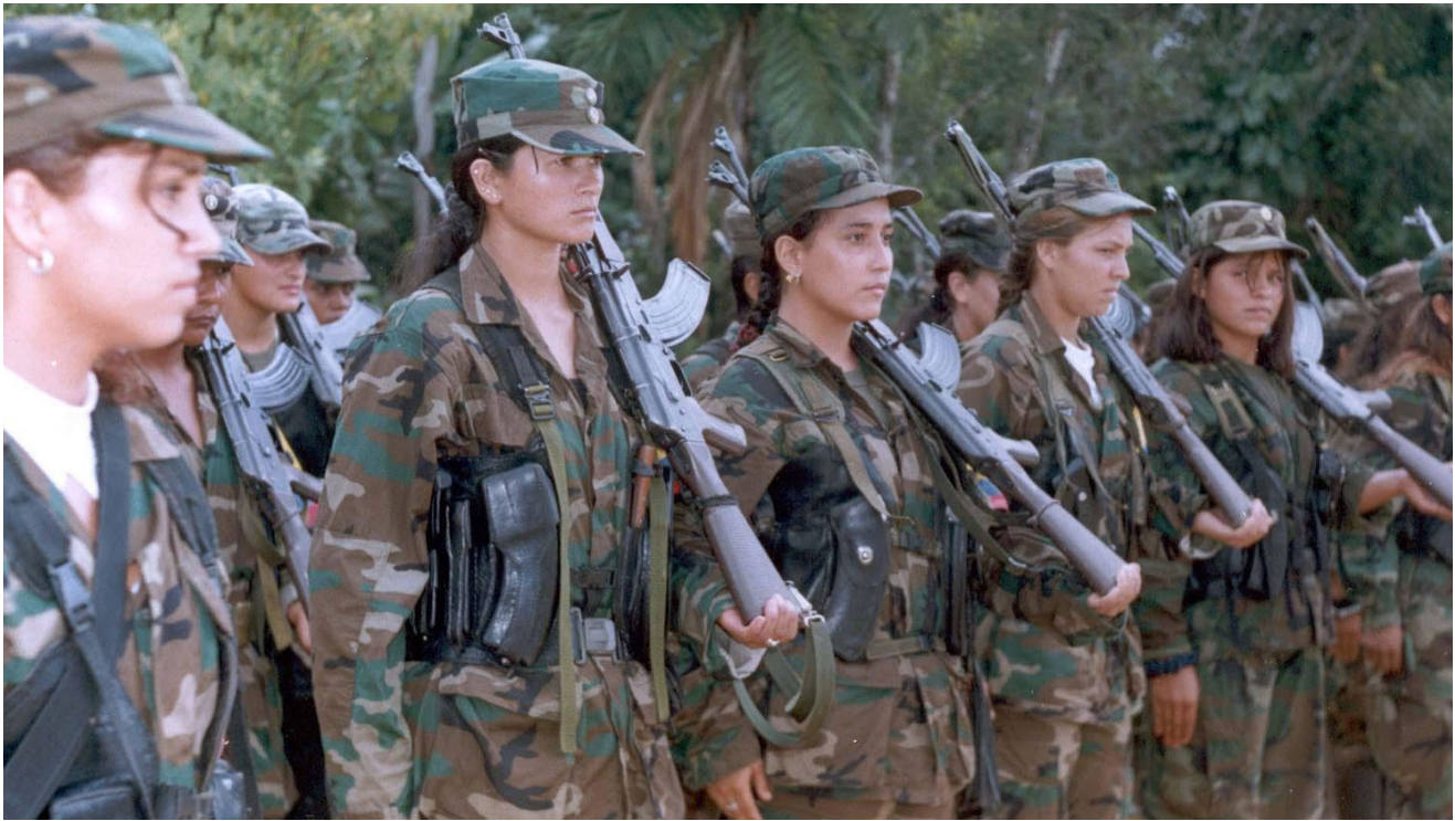
Photo caption: FARC rebels in ranks.

The landmark 2016 Colombian peace agreement mentions the word “mujer” (the Spanish word for woman) 197 times. In fact, this agreement was notable for the incorporation of a gender perspective in its negotiation agenda, in addition to ending a six-decade conflict that resulted in the deaths of more than 220,000 people and displaced more than 5 million. During the final years of the conflict, the Revolutionary Armed Forces of Colombia—People’s Army (FARC-EP in Spanish) made a notable effort to publicize the participation of women in the organization. From documentaries highlighting the role women played to public appearances and pronouncements from the few high-ranking women in the organization, the FARC worked to paint an image of itself as a champion of women’s rights and equality.